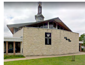
Manchester Methodist Church