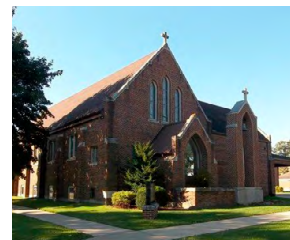
First Evangelical Lutheran Church