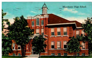
Manchester High School

The Thursday December 8, 1949 edition of the Manchester Press included an article: "Manchester Group is host to 500 at the gymnasium." The special A.A. gathering took place on Monday December 5, 1949 to observe Manchester's A.A. anniversary. The overcrowded Manchester high school gymnasium that night featured a lawyer from Lancaster, Wisconsin, as the A.A. speaker.