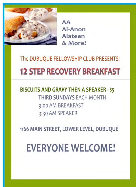
Dubuque Fellowship, Current

Downloadable copies of most of these events are at DubuqueAA.org