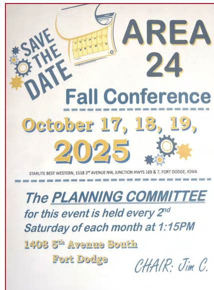
Fort Dodge, October 17-19