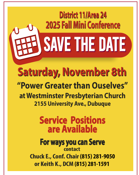
Dubuque, November 8

Check Dubuqueaa.org for downloadable copies of many of these events.