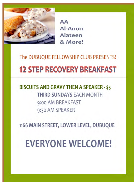
Dubuque Fellowship, December