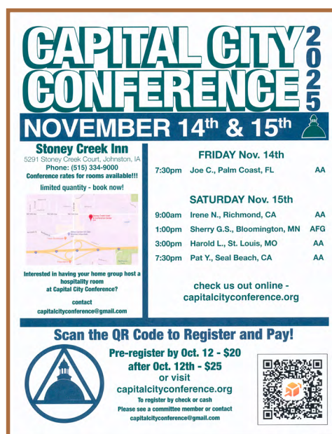
Des Moines, November 14–15